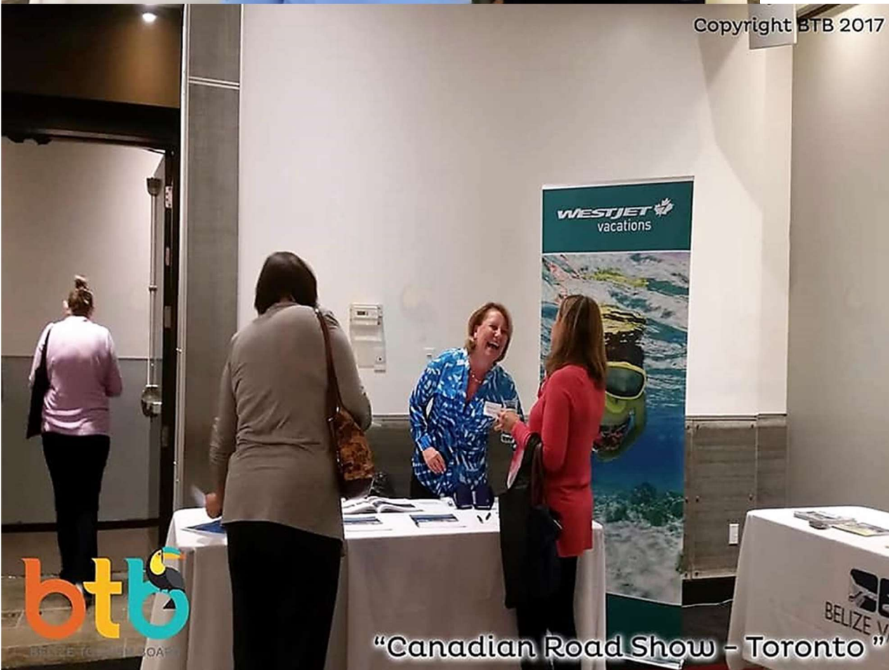
"Canadian Road Show - Toronto"