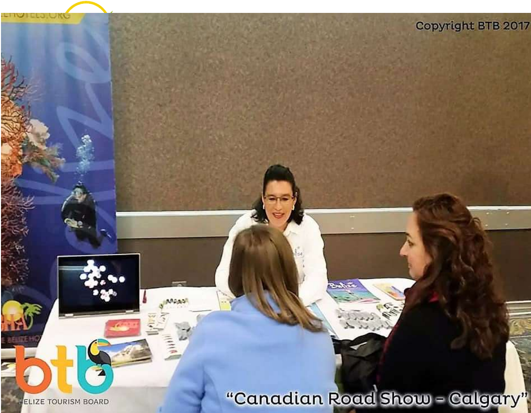
"Canadian Road Show - Calgary"